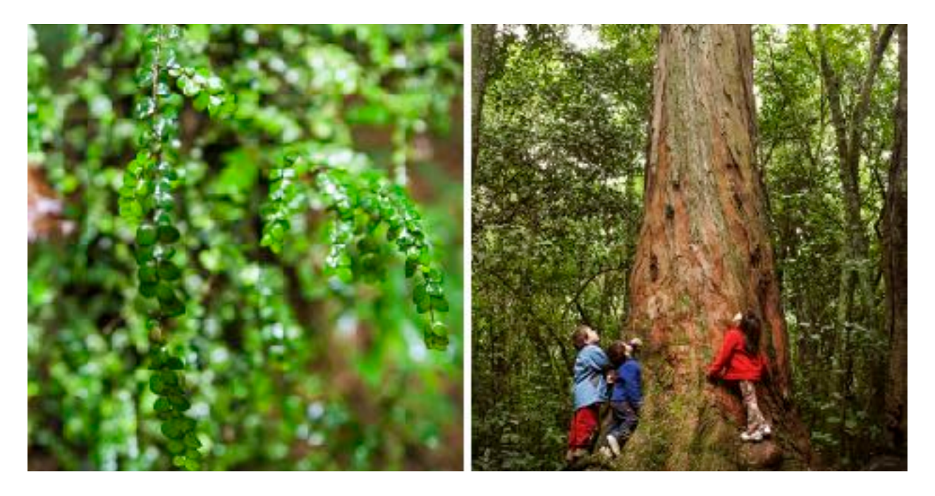
Fyffe Palmer Track

The Puhi Puhi Scenic Reserve is a protected significant Area of International Importance, renowned as a haven for a diverse array of rare and endangered native species of New Zealand flora and fauna. (30min)